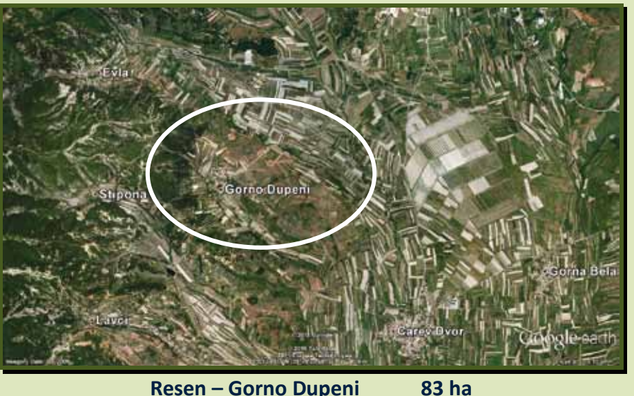
Resen - Gorno Dupeni