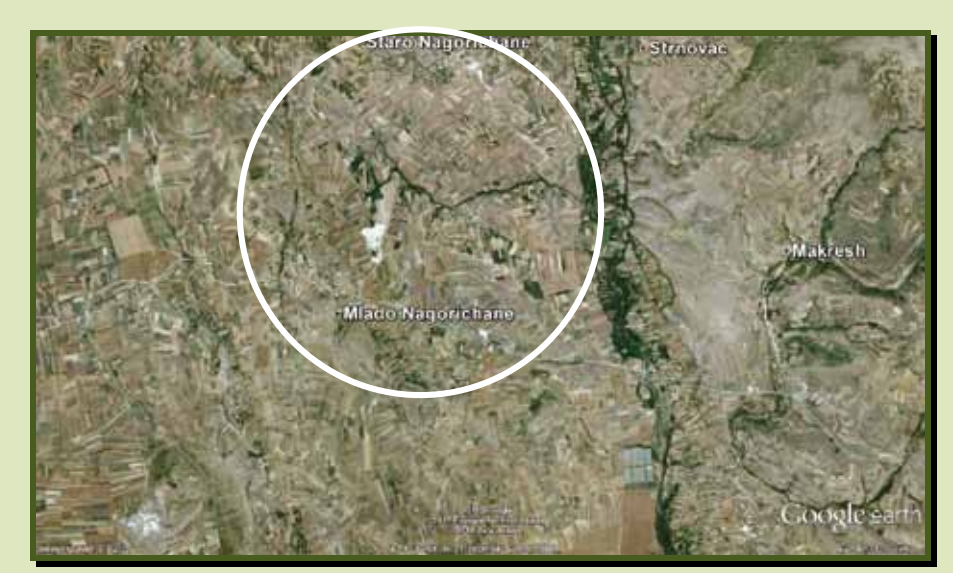
Kumanovo - Nagorichane 23 ha