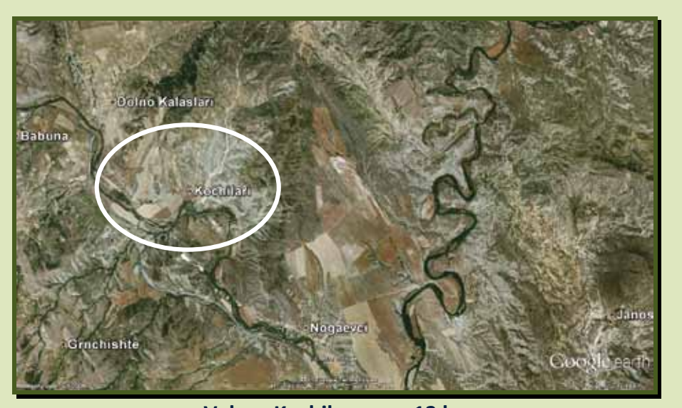
Veles - Kochilary 13 ha