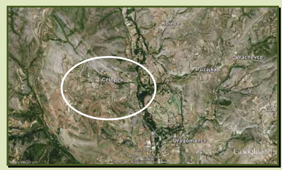
Kumanovo - Celopek 26 ha