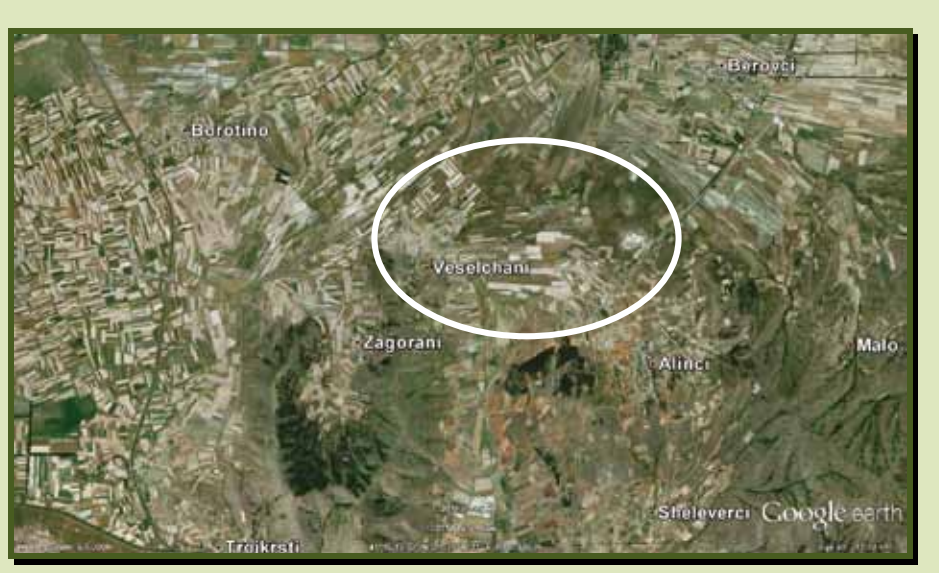
Prilep - Veselchani 48 ha