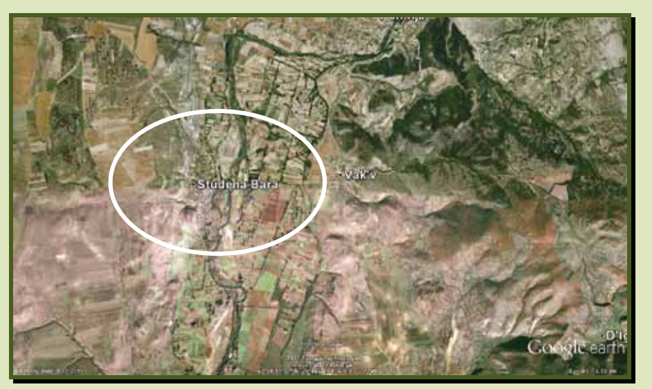
Kumanovo – Studena bara 154 ha