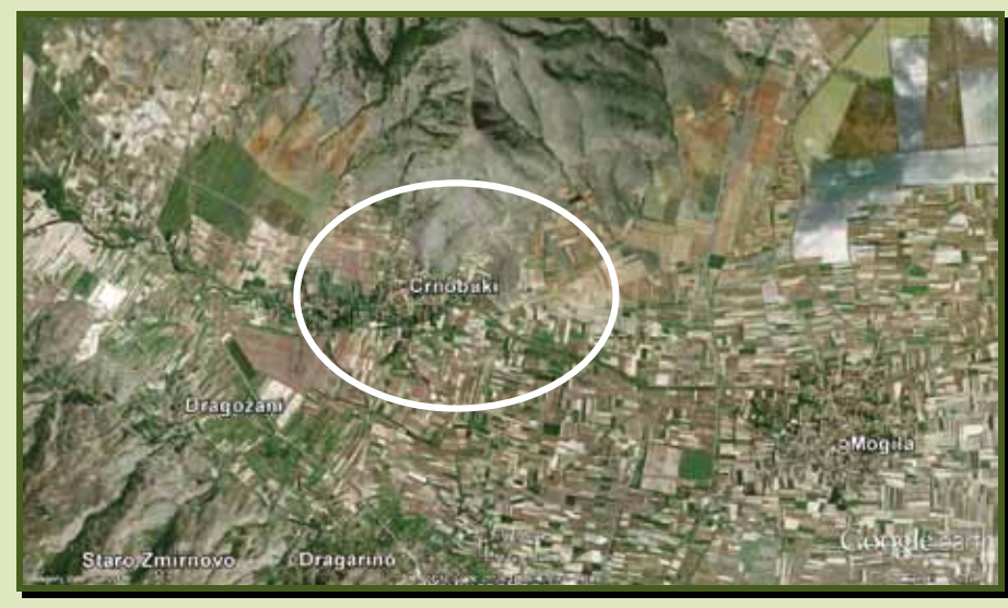
Bitola - Crni Buki 35 ha