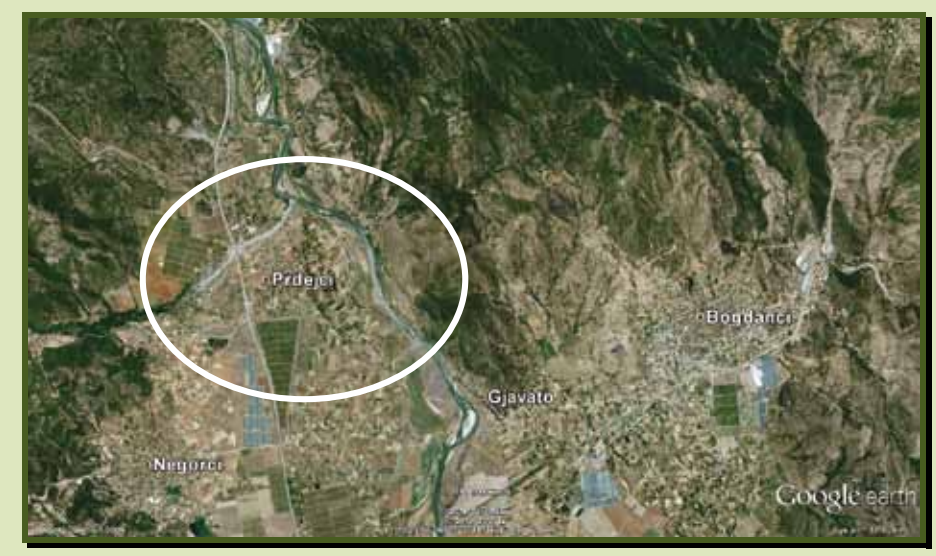
Gevgelija - Prdejci 84 h