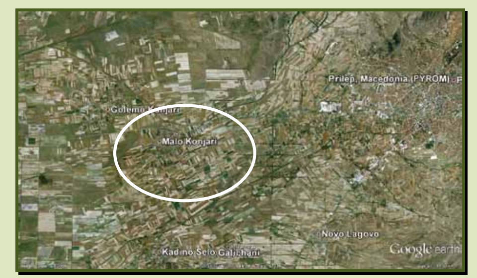
Prilep - Malo Konjari 80 ha