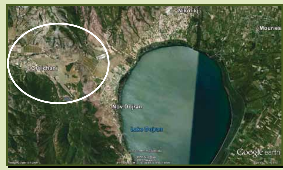
Gevgelija - Crnicani 76 ha