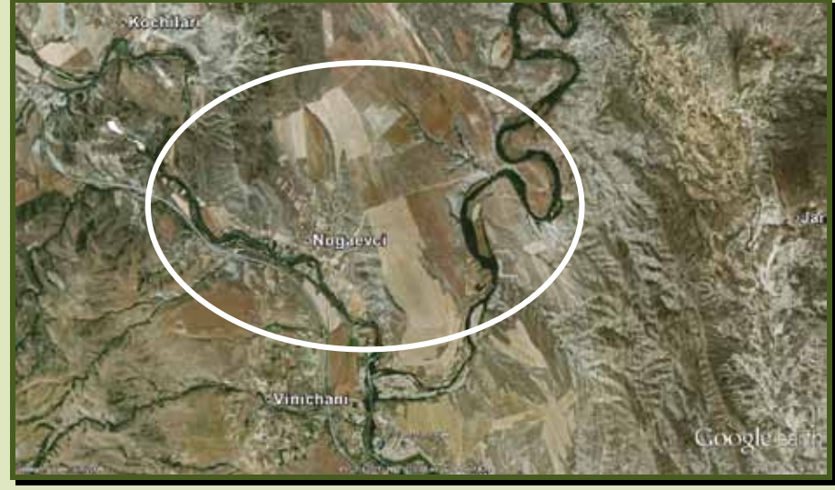
Veles - Nogaevci 592 ha