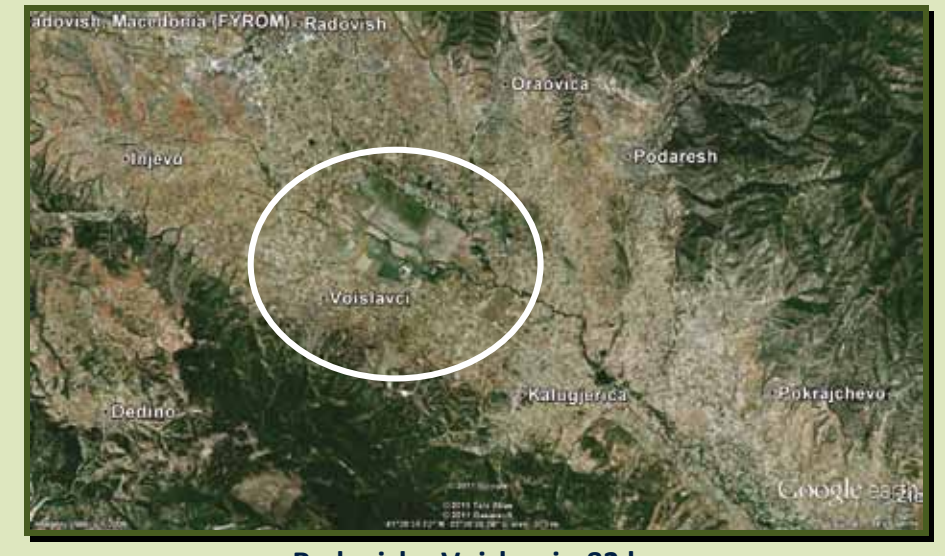
Radovish - Voislavci 83 ha