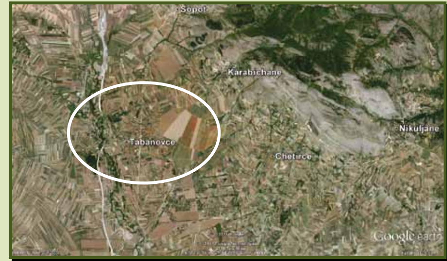
Kumanovo - Tabanovce 20 h