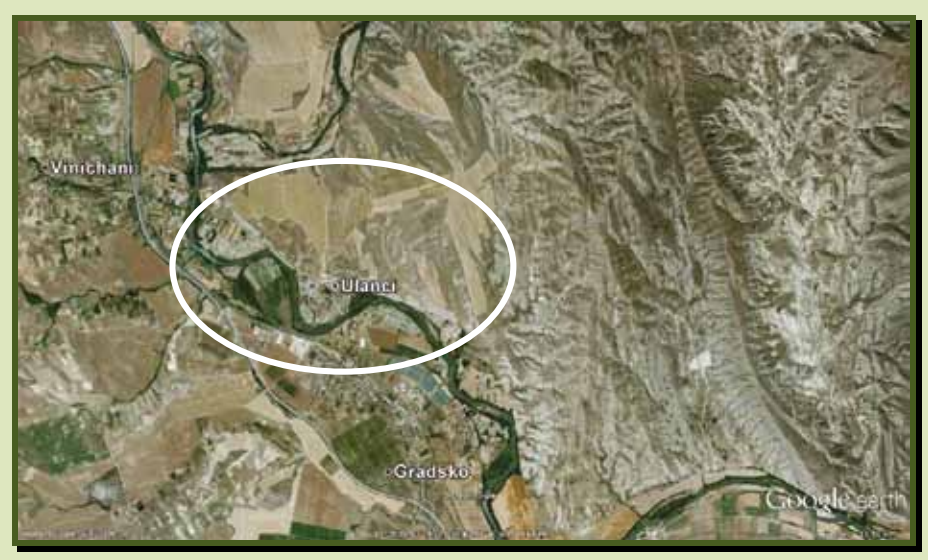
Veles - Ulanci 179 ha