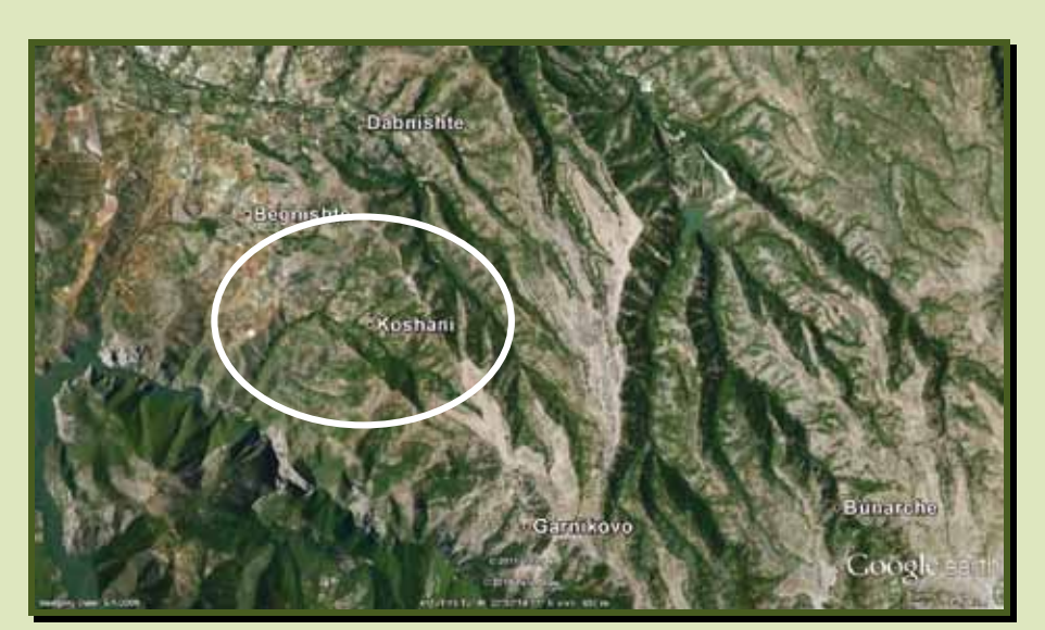
Kavadarci - Koshani 7 ha