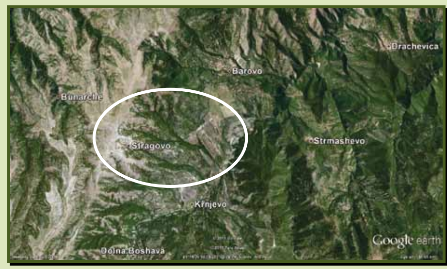
Kavadarci - Stragovo 206 ha