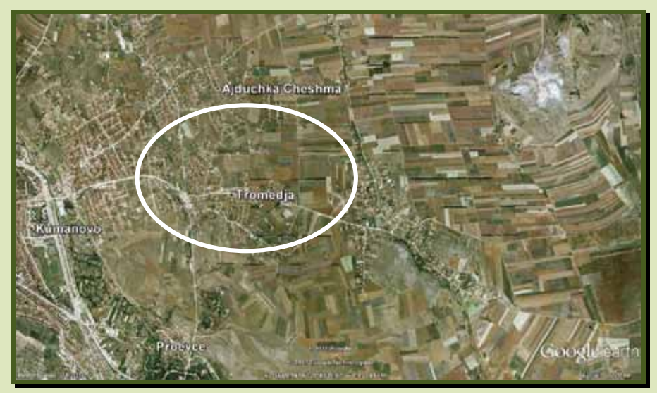
Kumanovo - Tromegja 49 ha