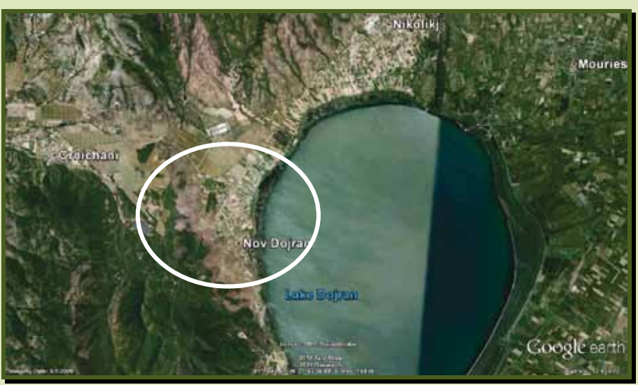
Gevgelija – Nov Dojran