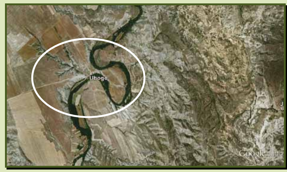
Veles - Ubogo 120 ha