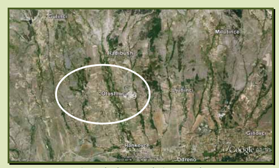
Kriva Palanka - Otoshnica 75 ha