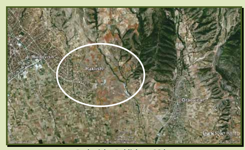
Radovish - Raklish 28 ha