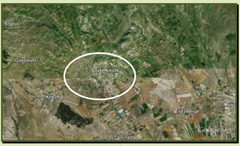
Sveti Nikole 10 ha