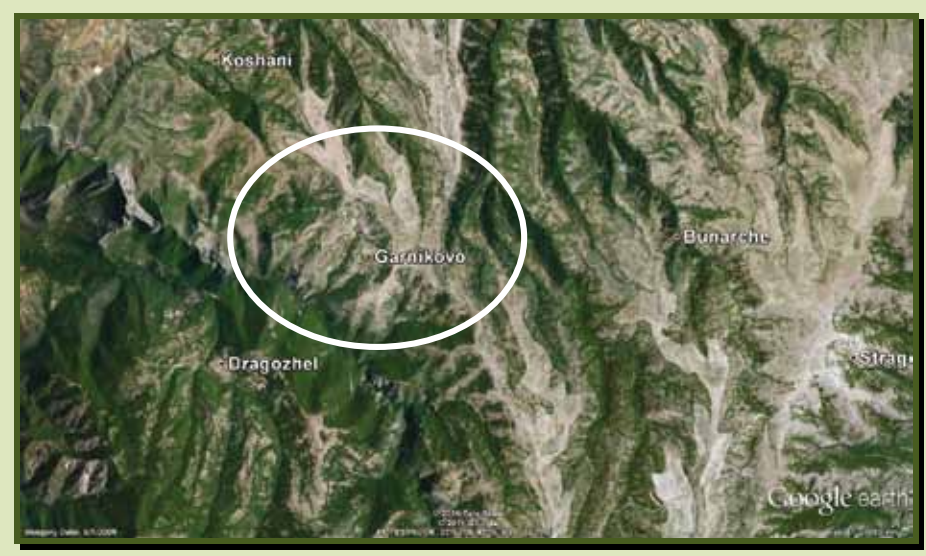
Kavadarci - Garnikovo