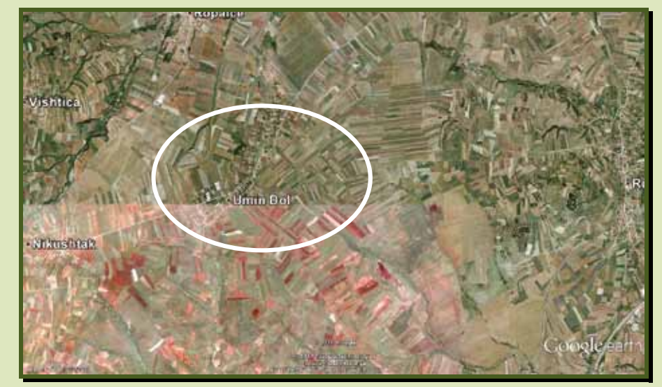
Kumanovo – Umin Dol