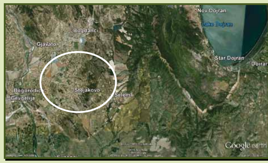
Gevgelija - Stojakovo 23 ha