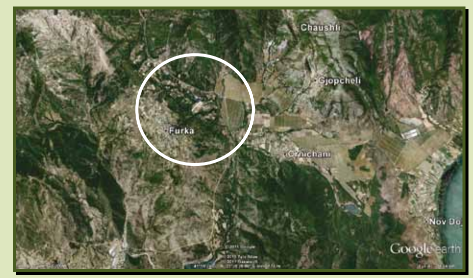
Gevgelija - Furka