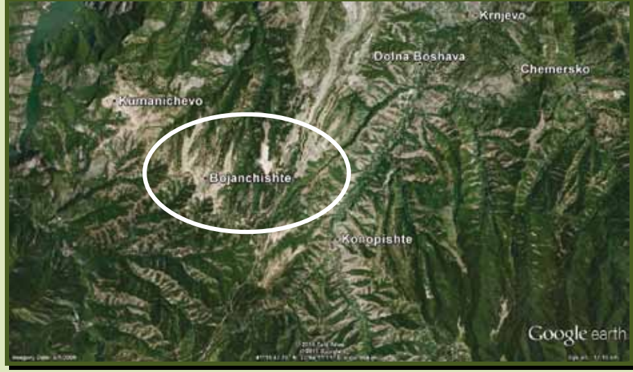
Kavadarci - Bojanishte