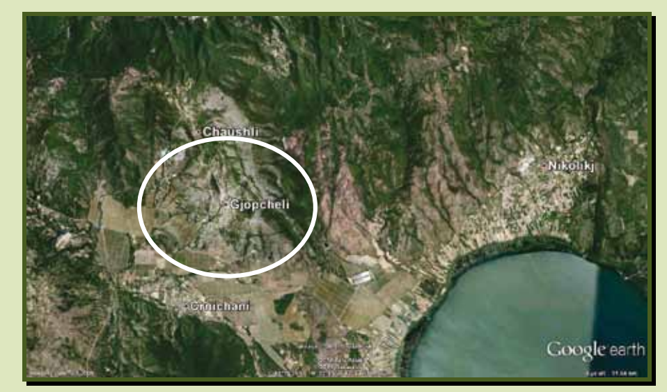
Gevgelija - Gjopceli 59 ha