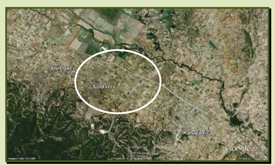
Radovish - Surdulci 20 ha