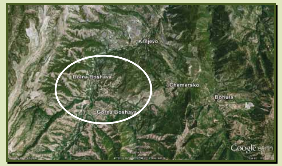
Kavadarci - Boshava 38 ha