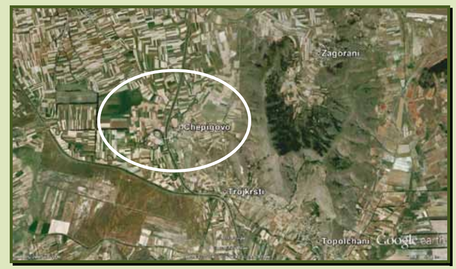
Prilep - Chepigovo 17 ha