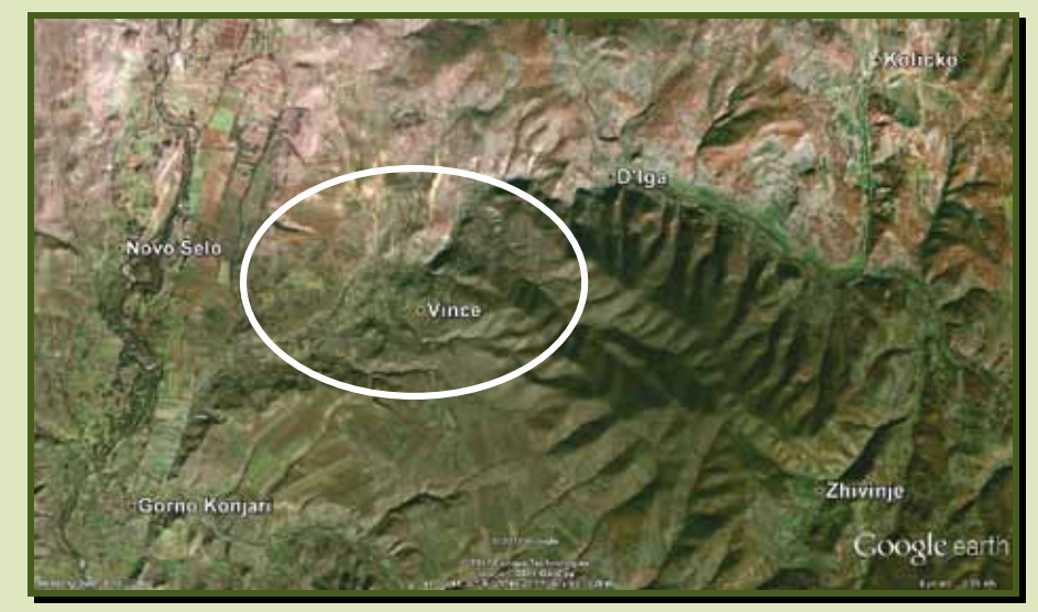
Kumanovo - Vince 18 ha