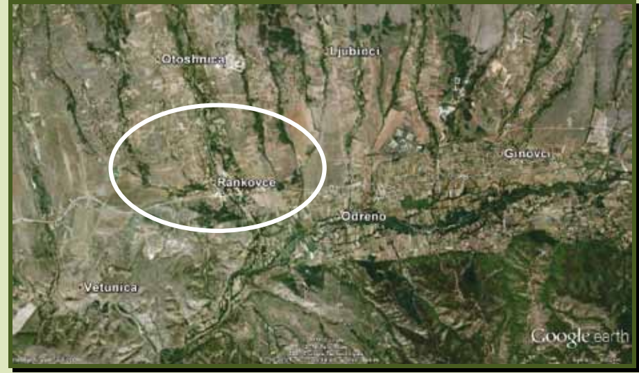
Kriva Palanka - Rankovce 5 ha